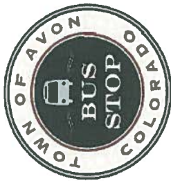
EXHIBIT 1. AVON TRANSIT "INTERIM" BUS SCHEDULE